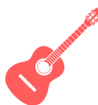
GUITAR & UKULELE